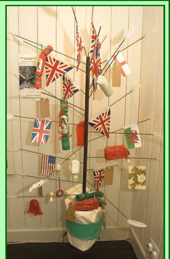
Replica of 1911 Scott Expedition Xmas Tree

There were seasonal sing-alongs on both Saturday afternoons and a Naughty Penguin Trail in the museum which the children thoroughly enjoyed