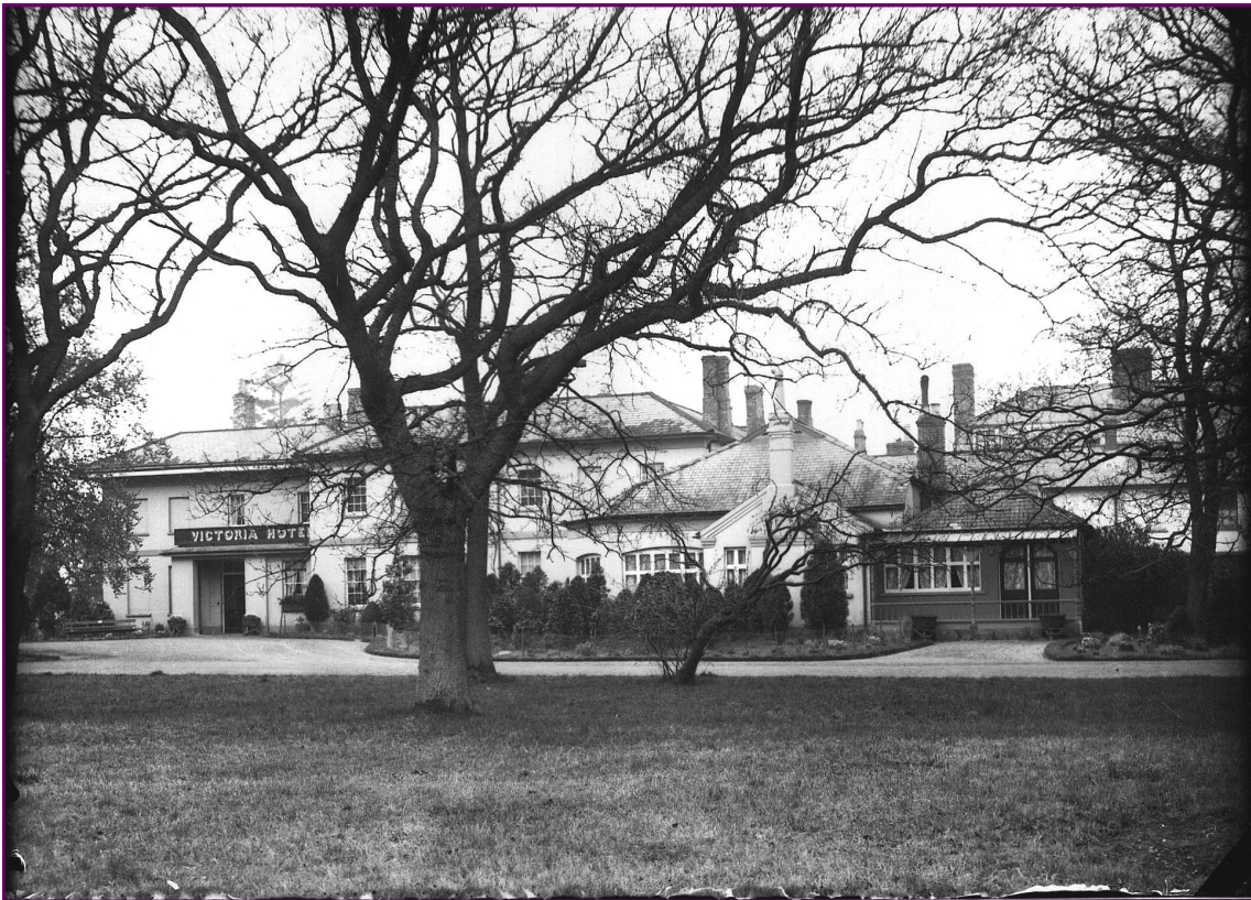
The celebrated and fashionable Victoria Hotel, Woodhall Spa.

An entertainment at Christmastide raised an admirable £48-14s-11d for heating apparatus for St. Peter's Church. We hear that villagers have so far raised the prodigious amount of over £500 for a war memorial in the church! It is to be a rood screen of carved oak, with the names of our fallen commemorated upon it.