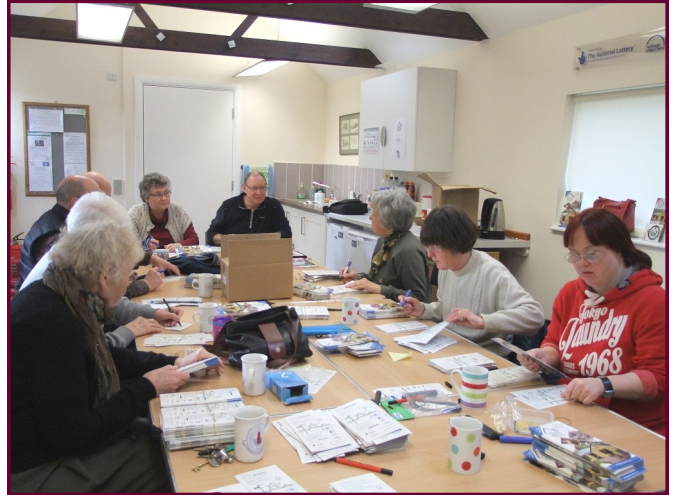
Volunteers sorting publicity leaflets

We look forward to meeting new supporters. Please make contact in the usual way by emailing info@cottagemuseum.co.uk , phone 01526 352456 or write to Woodhall Spa Cottage Museum, Iddesleigh Road, Woodhall Spa, LN10 6SH. We look forward to hearing from you.