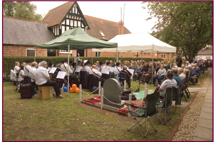
The National Lottery Grant will allow additional shelter for performers and audience alike