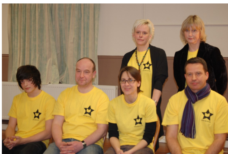
Members of local band STAR ME KITTEN who are raising money for Woodhall Spa charities in February and March 2012