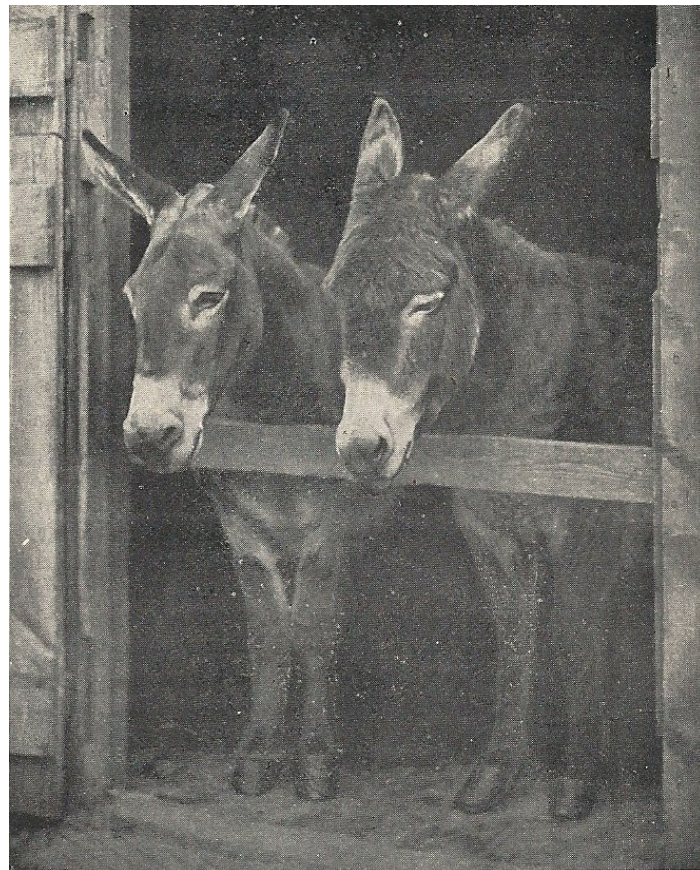
HANDSOME IS AS HANDSOME DOES.