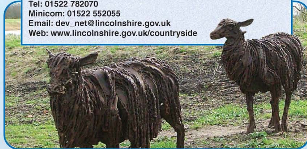
The Water Rail Way

Lincolnshire County Council Natural Environment Team Tel: 01522 782070 Minicom: 01522 552055 Email: dev_net@lincolnshire.gov.uk Web: www.lincolnshire.gov.uk/countryside