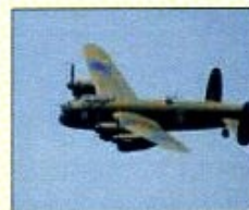
Woodhall Spa Forthcoming At- tractions of an His- toric Nature