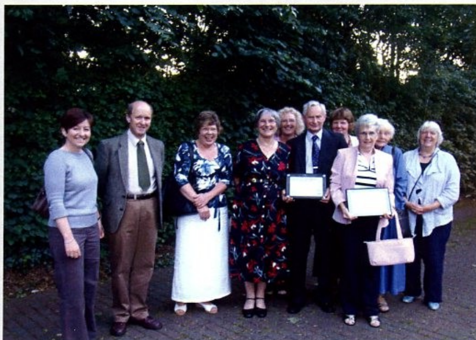
The Victorious Team!